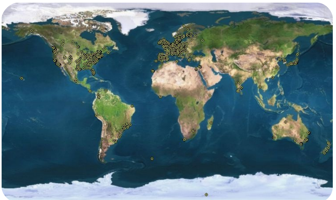
Debian developers around the world

One of the Debian project's key strengths is its volunteer base. Communication is done mainly through the Internet, using mailing lists and chat. Although this type of communication works effectively, some discussions can take a long time. This is where DebConf shows its potential in helping the project.